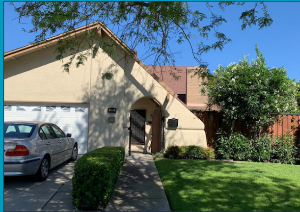
CityTeam Youth Collective home for women, ages 18-24, in South San Jose.